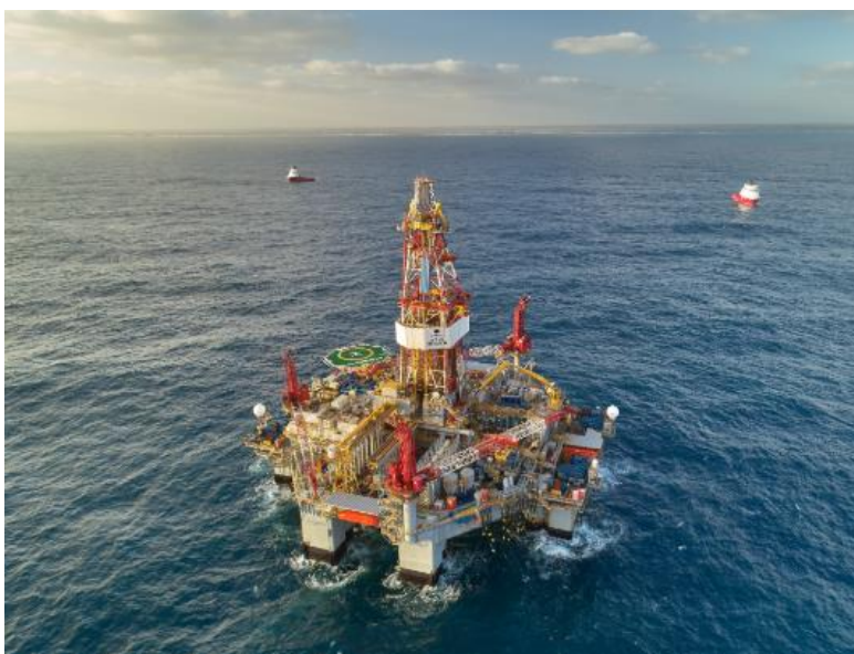
Offshore Drilling Rig at the Annie-1 well location. Otway Basin. September 2019.